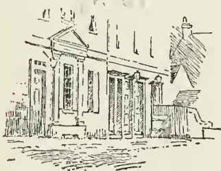
The Old Theatre, Bath

21225 With Colored Illustrations by C. E. and H. M. BROCK